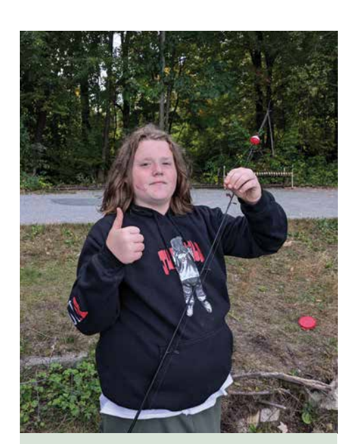
Kyon's always up for a fishing trip!