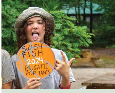
Iroquois – basketball champ!